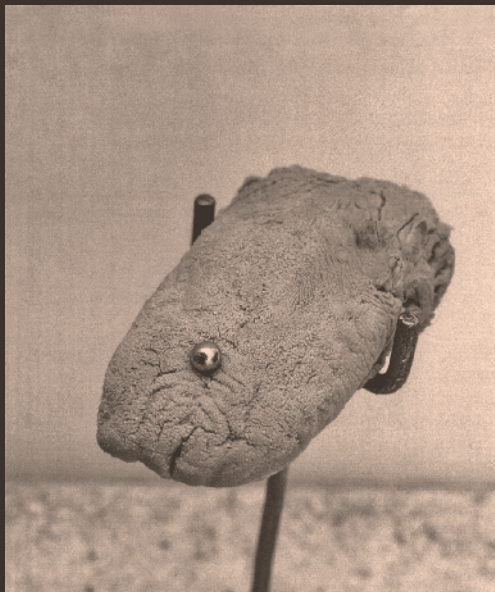
Teresa Margolles Lengua / Tongue, 2000 Object, human tongue Unique Courtesy of the artist and Galerie Peter Kilchmann, Zurich