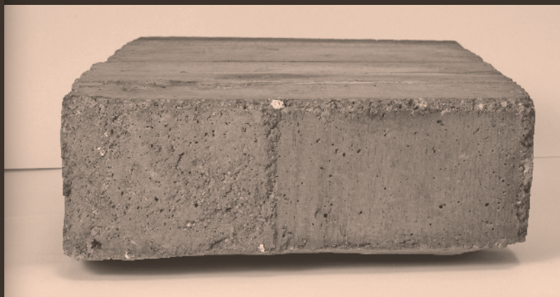
Teresa Margolles Entierro / Burial, 1999 Fetus in a block of cement 15.5 x 66 x 43 cm (6 1/8 x 26 x 16 7/8 in.) Courtesy of the artist and Galerie Peter Kilchmann, Zurich Exhibition view, "Muerte sin fin", MMK Museum für Moderne Kunst, Frankfurt am Main, cur. Udo Kittelman, 2004. Photo: Axel Schneider, Frankfurt am Main

Dutch criminal law does not contain any provisions regarding violation of the human cadaver itself, although it does deal with the desecration of resting